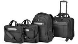
Professional, Business & Essential Series